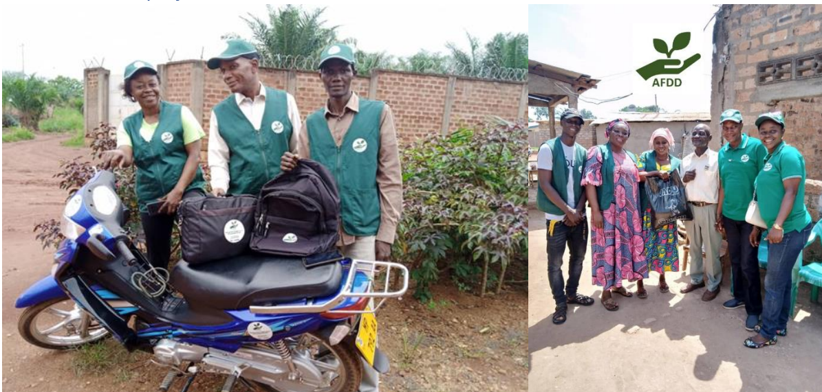
Project team with the chief of village Gbanikola